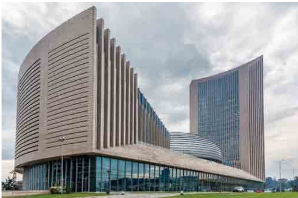
African Union headquarters, Addis Ababa, Ethiopia

Despite the apparent importance placed on regional integration by Africa's development strategies, serious doubts have been raised about the efficacy of the efforts to achieve it. Integration remains one of contemporary Africa's leading unresolved governance questions. An understanding of the dynamics involved in the continent's integration endeavours is crucial if they are to yield their envisaged benefits.