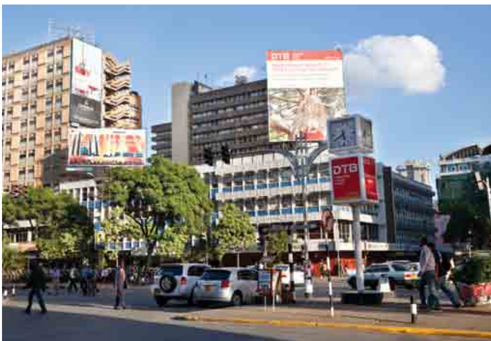
Nairobi city centre