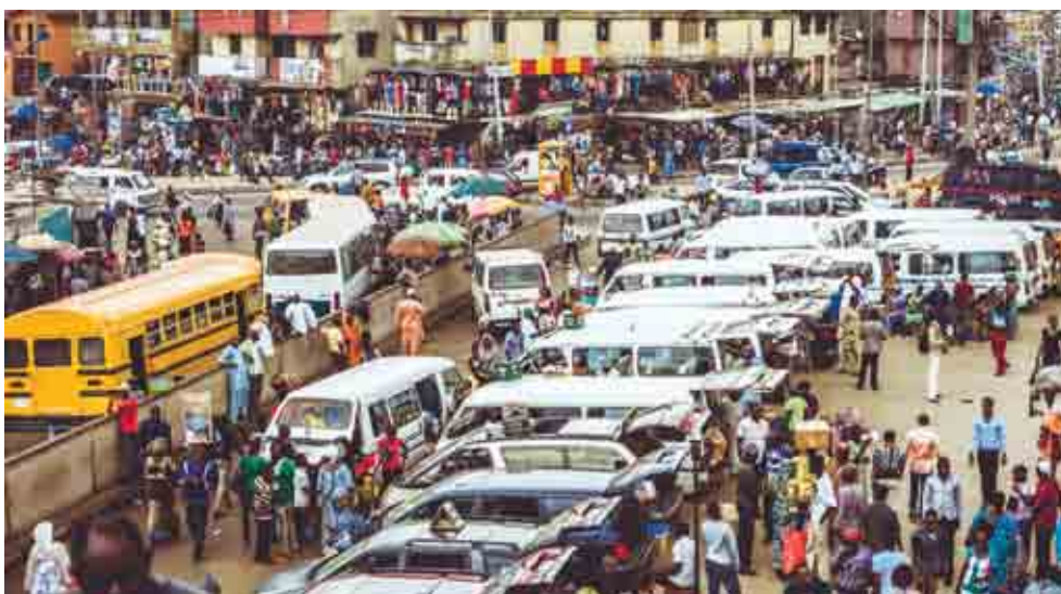
Transport hub in Lagos, Nigeria

In discussing regional integration, the CCRs point out that the key issues relate to the difficulties in steering complicated reforms necessary in integration processes, such as implementing trade policy or regional protocols. This is discussed in the reports on Uganda, 120 Benin 121 and Tanzania. 122 Similarly, many countries have serious policy gaps, suggesting a lack of preparedness to deal with the challenges posed by engagement with the outside world. The Mozambican government, for example, views tourism as a major wealth creator, but the CRR notes that at the time the review was conducted it had no tourism policy. 123 Likewise, Lesotho has no ‘documented’ trade policy, only an ‘implied’ one. 124