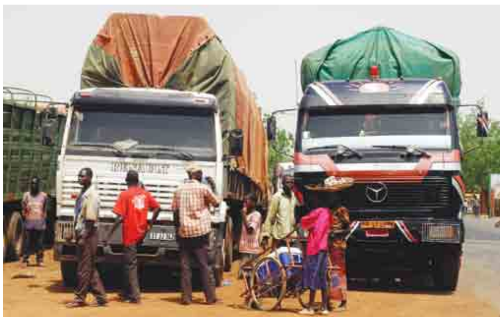
Koupela, Burkina Faso is a hub for road transport across African countries