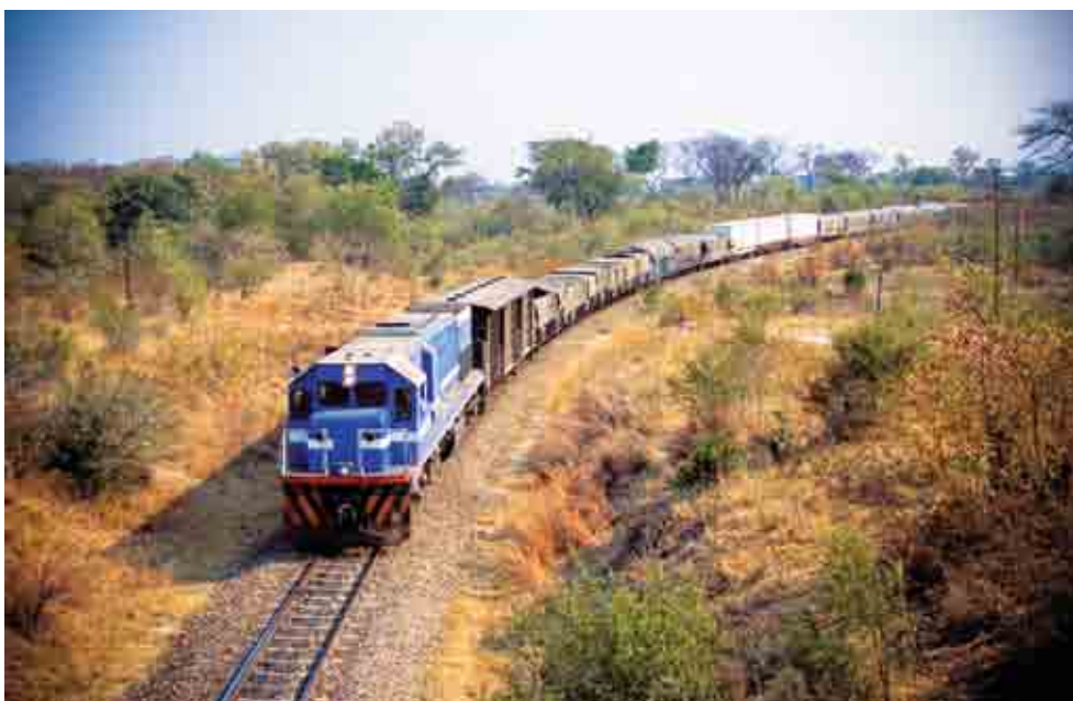
A cargo train is hauled by a blue diesel locomotive as it passes en route to Zambia from Zimbabwe