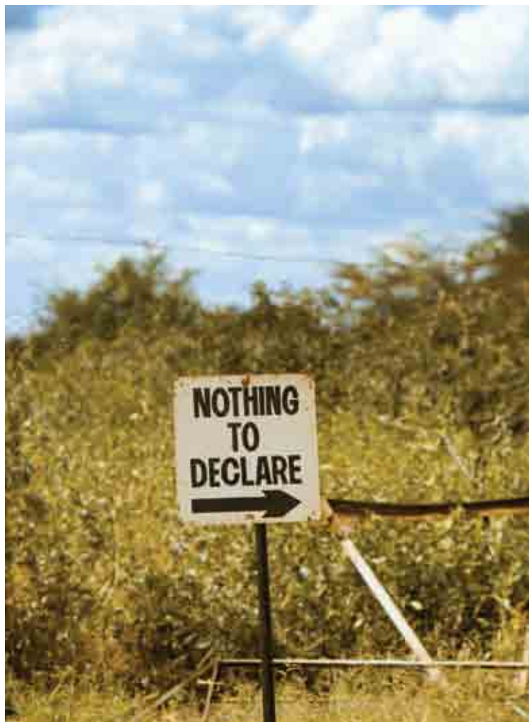
Zimbabwe and Botswana customs post

The progress made in integration across the various RECs has been uneven. Taking the common commitment of the continent towards the AEC as a reference point, Dr Amadou Sy of the Brookings Institution groups Africa’s RECs into those that are ‘progressing’ and those that are ‘lagging’. Seen in the light of movement towards free trade areas, customs unions and common markets, the EAC, COMESA, ECOWAS and SADC have demonstrated considerably more resolve than CEN-SAD, IGAD and the AMU. Thus, while each of the ‘progressing’ groupings has made moves of some magnitude towards (at least) free trade areas, none of the ‘lagging’ groupings has. 22