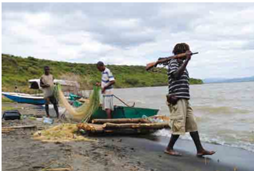
In Nechisar National Park, not far from the town of Arba Minch, three Ethiopians stand on the lakeshore. Two are tending to a fishing net. One other is walking with a rifle on his shoulder, carried for self-defence given the history of tribal conflict in the area

Source: http://www.istockphoto.com/photo/fishing-nets-and-rifles-17164501?st=7ab7d22